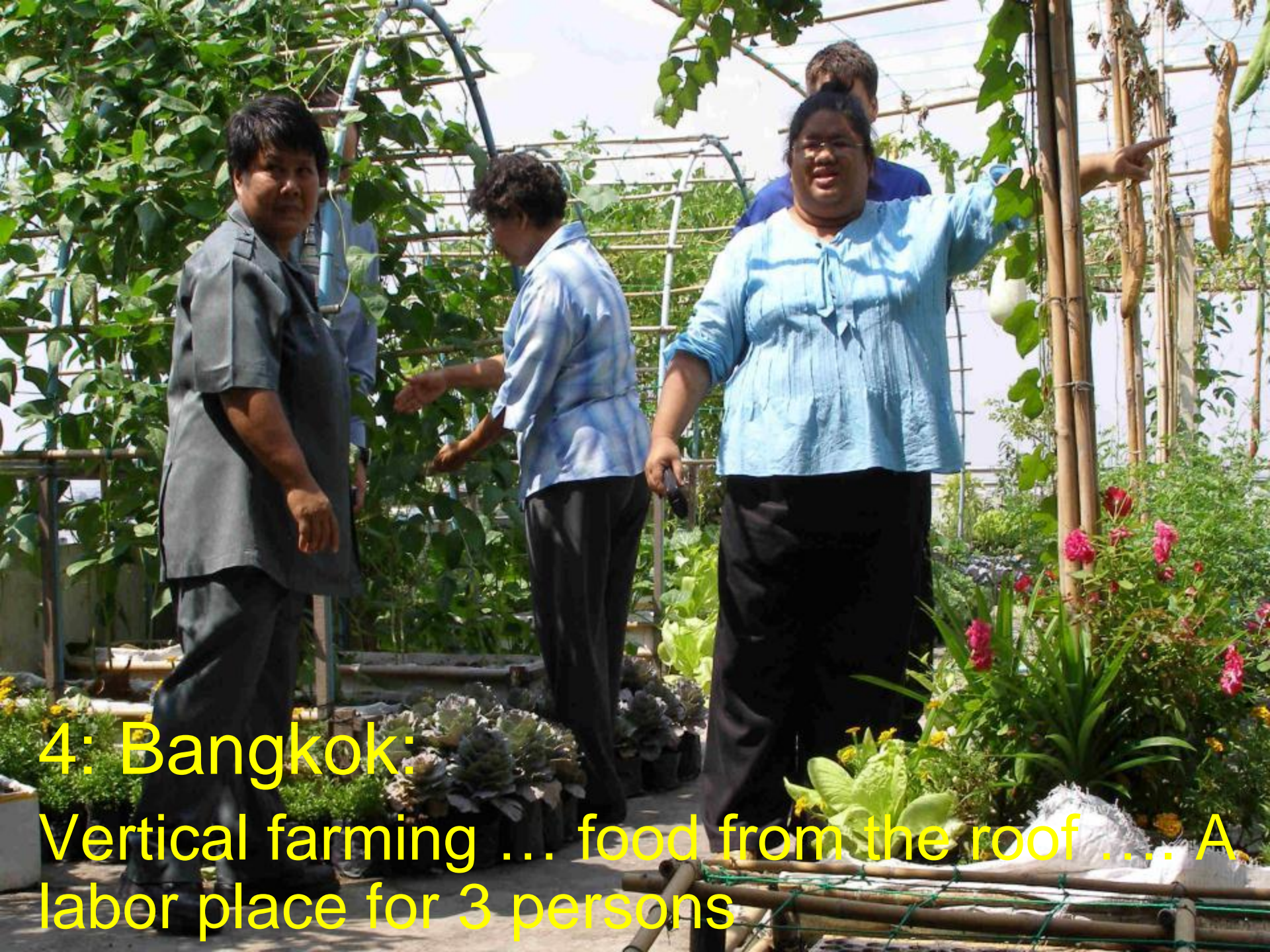
4: Bangkok: Vertical farming ... food from the roof ... A labor place for 3 persons